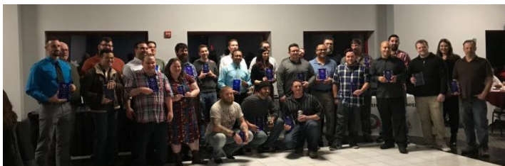
Our largest group shot award as always, goes to our Autocross (Solo) award winners!