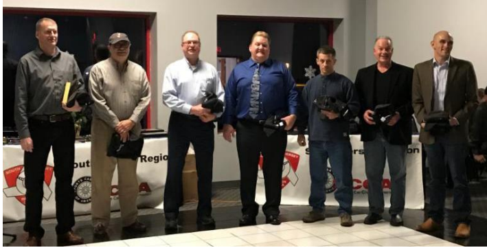
Some of our NJRRS Road Racing award winners.