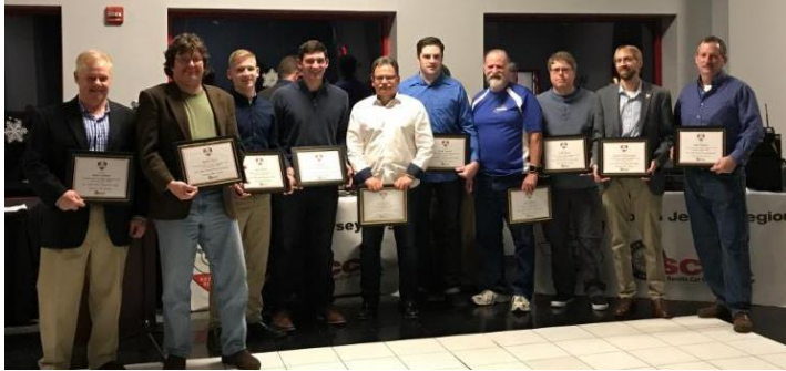
Some of our Region 84 participants at this year's Runoffs receive their plaques in recognition for their great job representing the Region.