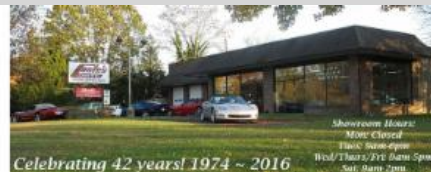
Celebrating 42 years! 1974 ~ 2016