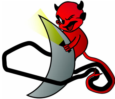
THE DEVIL IN THE DARK